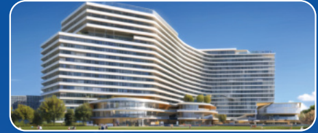
Hospitality & Tourism